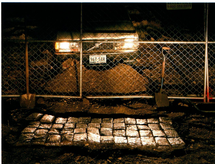
Below: Matheus Rocha Pitta, Untitled (Still from Drive Thru #1) , 2007, color photograph, 35 1/2 x 47 1/2".