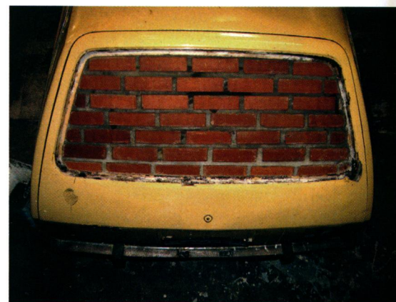
Above: Matheus Rocha Pitta, Drive-In , 2005, 1979 Ford Belina, bricks, cement, black velvet, newspaper clippings, headlights, dimensions variable. Exterior views.