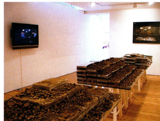
Above: View of “Matheus Rocha Pitta: Drive Thru #1,” 2008, Sprovieri Gallery, London. On wall, from left: Drive Thru #1 , 2007; Untitled (Still from Drive Thru #1) , 2007. On floor, foreground to background: Apprehension Table #2 (Pyramid) , 2008; Apprehension Table #1 (Wall) , 2008; Apprehension Table #3 (Fortress) , 2008.

IN THE 1970S, seminal works of Conceptual art such as Cildo Meireles's “Insertions into Ideological Circuits,” 1970, harnessed the circulatory flows of existing economic and political systems in order to interfere with their reproduction of power. By printing